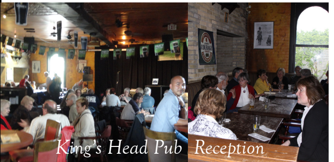
King's Head Pub Reception