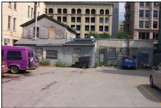
Second oldest structure within the downtown area, located behind the business block on Albert Street

Heritage Winnipeg is registered to speak at City Hall in delegation at the Standing Committee on Property & Development on January 9th, 2006 to support the grade 3 heritage designation by the Historical Buildings Committee on the Business block at 38-44 1/2 Albert Street. After the committee’s decision it will then go further on to the Executive Policy Committee and then the final decision will be made at the Council meeting.