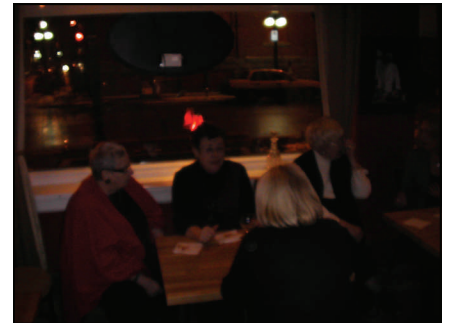
Members of the University Women's Club.