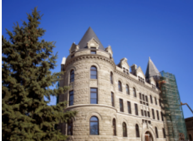
Wesley Hall – 515 Portage Avenue

After the awards ceremony the public enjoyed a reception with including a tour of Wesley Hall. Thank you to everyone who took the time to come out and celebrate our National Heritage Day with us!