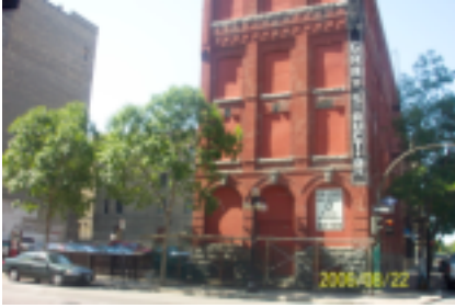
104 King Street