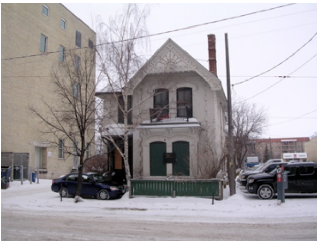
The Kelly House at 88 Adelaide Street

Heritage Winnipeg advocated the protection of this historic home from becoming a surface parking lot. In partnership with CentreVenture, we were successful in protecting this significant property and construction will begin in June 2009 with a $450,000 investment.