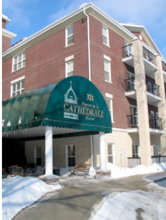
Manoir de la Cathedrale Manor 321 Avenue de la Cathedrale