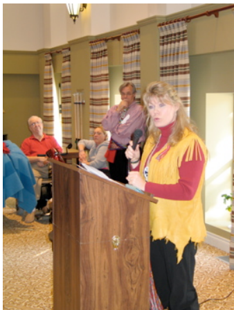
Ms. Shelly Glover, M.P., Saint Boniface