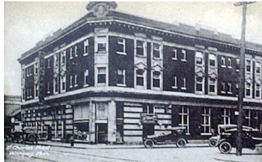
St. Charles Hotel – Archival photo