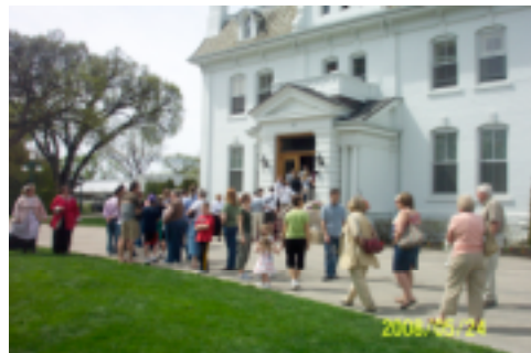
Government House/Grounds – approx. 2,000 people stopped by over the weekend.